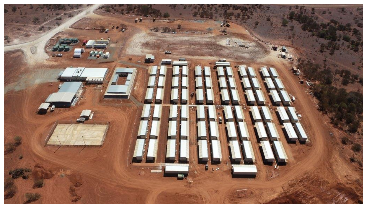
Figure 1. Aerial view of nearly completed Abra village.