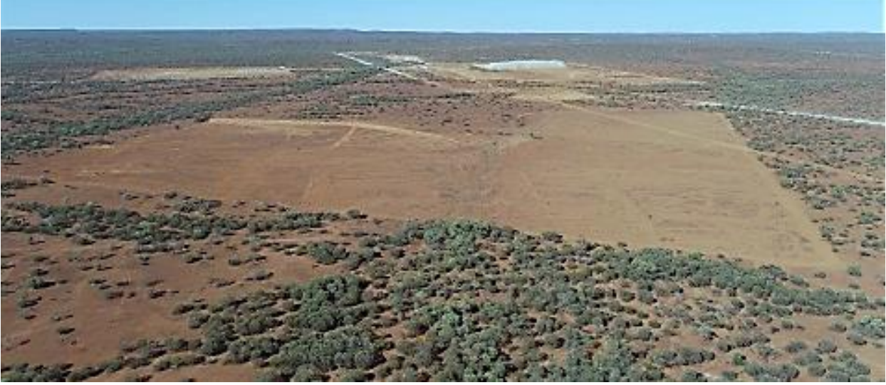
Figure 2. Aerial view of topsoil strip of TSF.