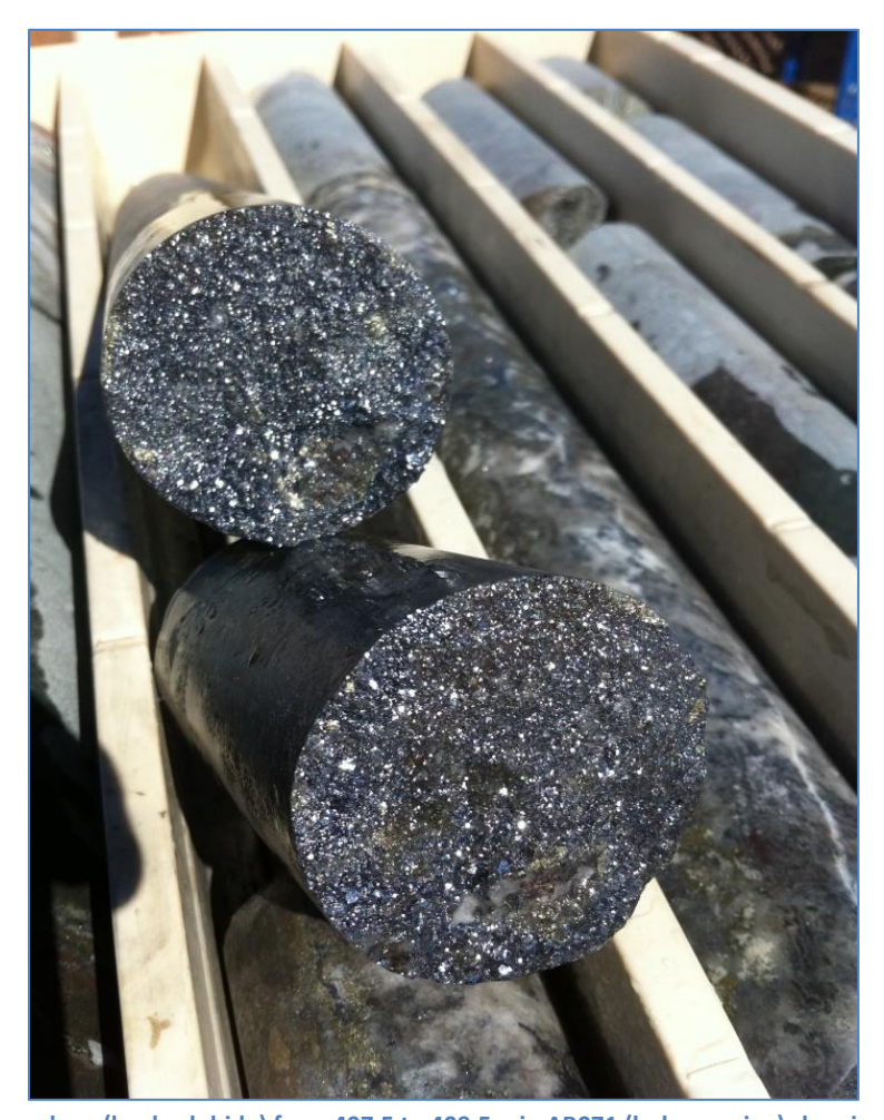
Figure 2: Massive galena (lead sulphide) from 407.5 to 409.5m in AB071 (hole ongoing) showing over 50% galena over 2 metres within a broader zone of +5% galena mineralisation over broad zones (+5 metres).

The original programme was proposed for 5,500m and has now been extended to 7,100m based on the encouraging results observed in drill core to date. Appendix 1 shows the Company's infill drilling programme and target areas. Appendix 1 shows a plan view of the drilling to date.