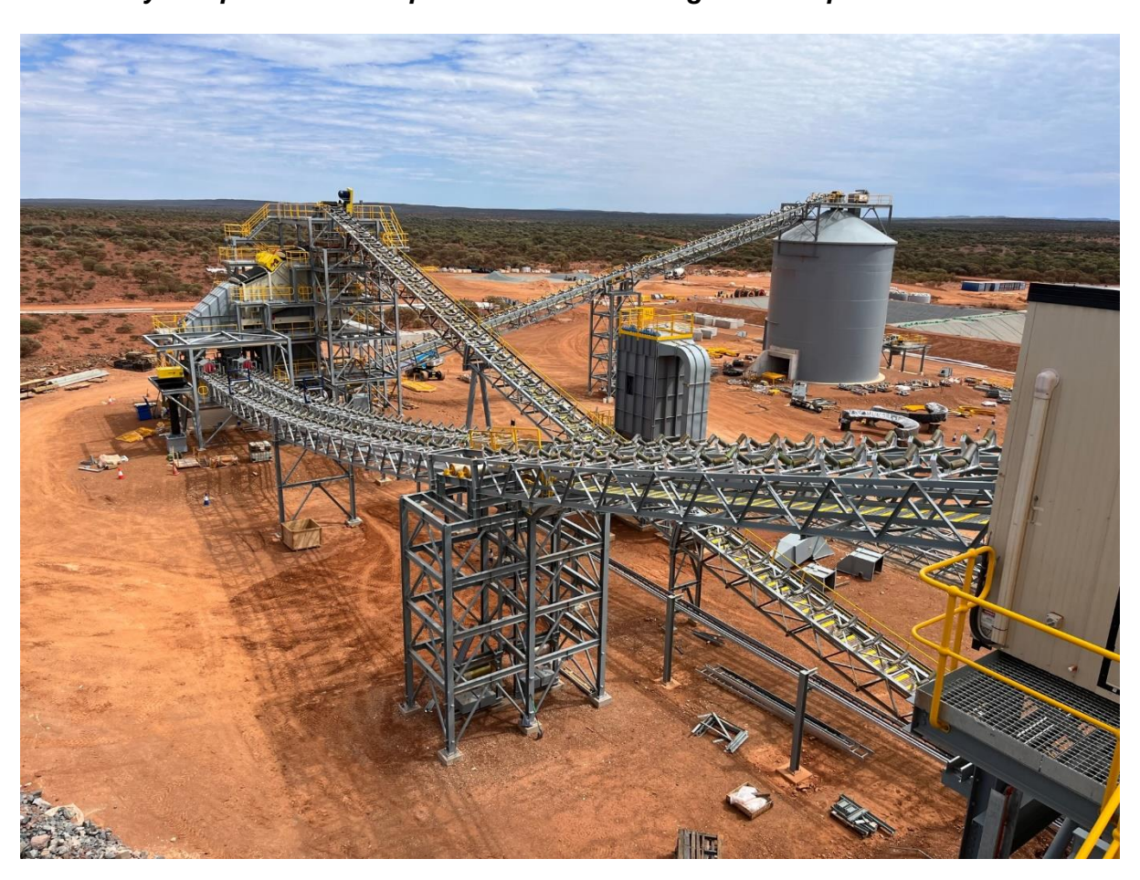
Figure 1 – Abra plant screening and materials handling (photo: 9 September).

Managing Director, Tony James commented, "With the flotation cells and the regrind mill landing in Australia, all the key pieces of equipment required for Abra processing facility have arrived. On site, construction activities have now past 83% with focus at the plant shifting to installation of the remaining mechanical items, piping and electrical installation. Operational readiness activities continue as the site prepares to start some early dry commissioning activities. It's also pleasing to see the TSF earthworks essentially completed and the power station reaching 94% completion".