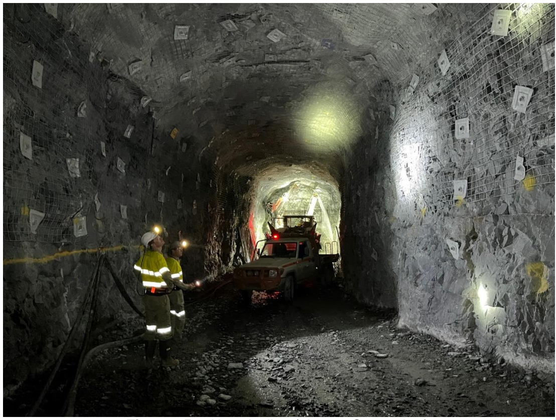
Figure 15 – Abra decline (photo 9 September).