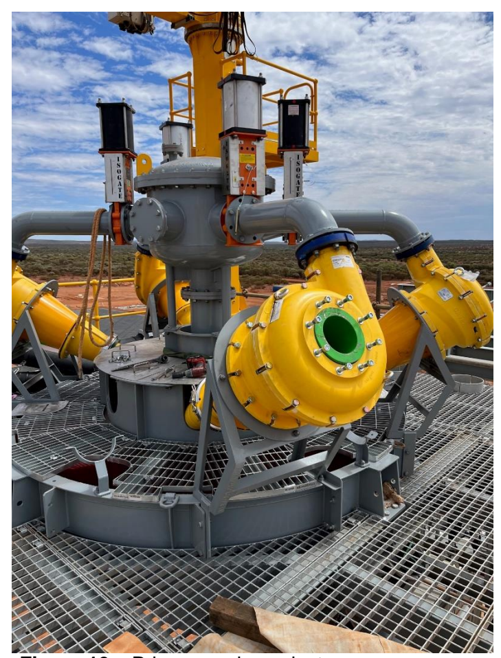
Figure 10 – Primary cyclone cluster (Photo 9 September).