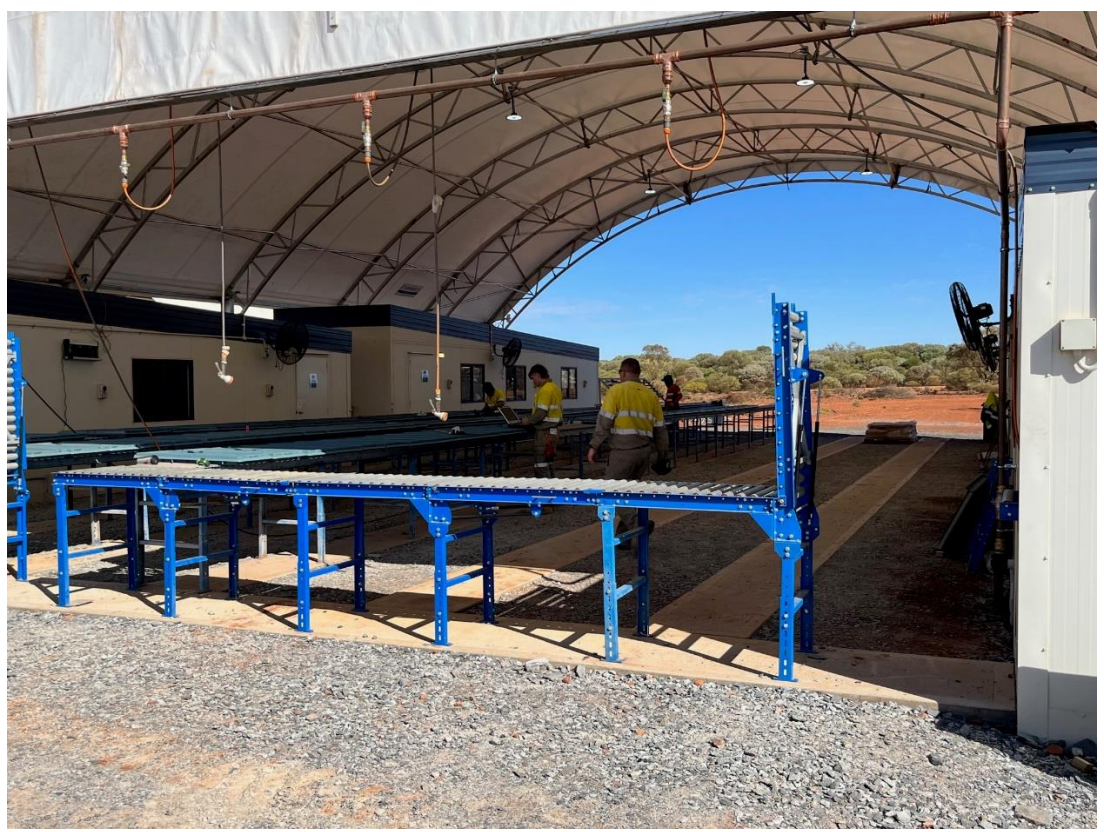
Figure 14 – Underground grade-control diamond core processing.