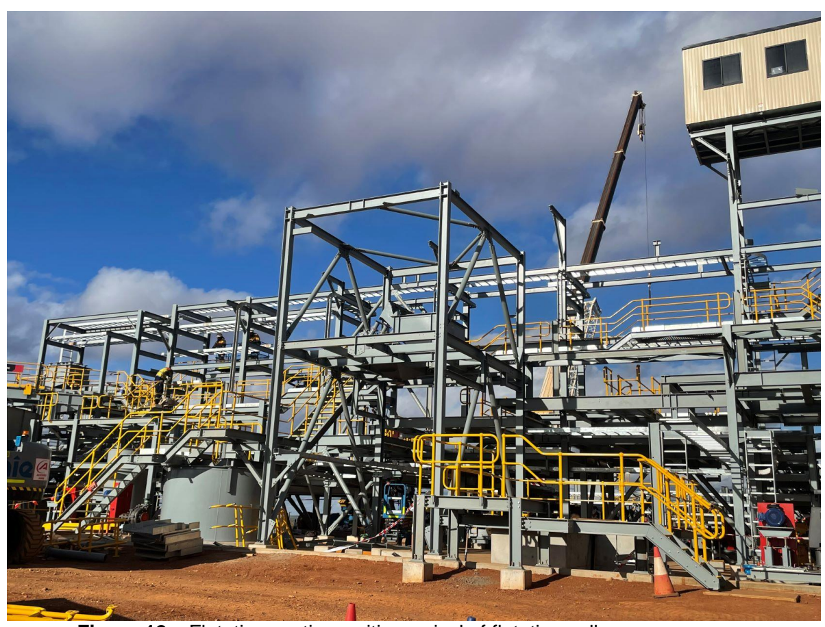
Figure 12 - Flotation section waiting arrival of flotation cells (photo 9 September).