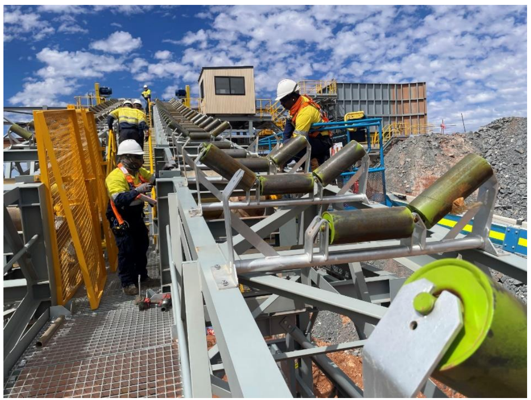
Figure 7 – Abra crushing section conveyor alignment work.