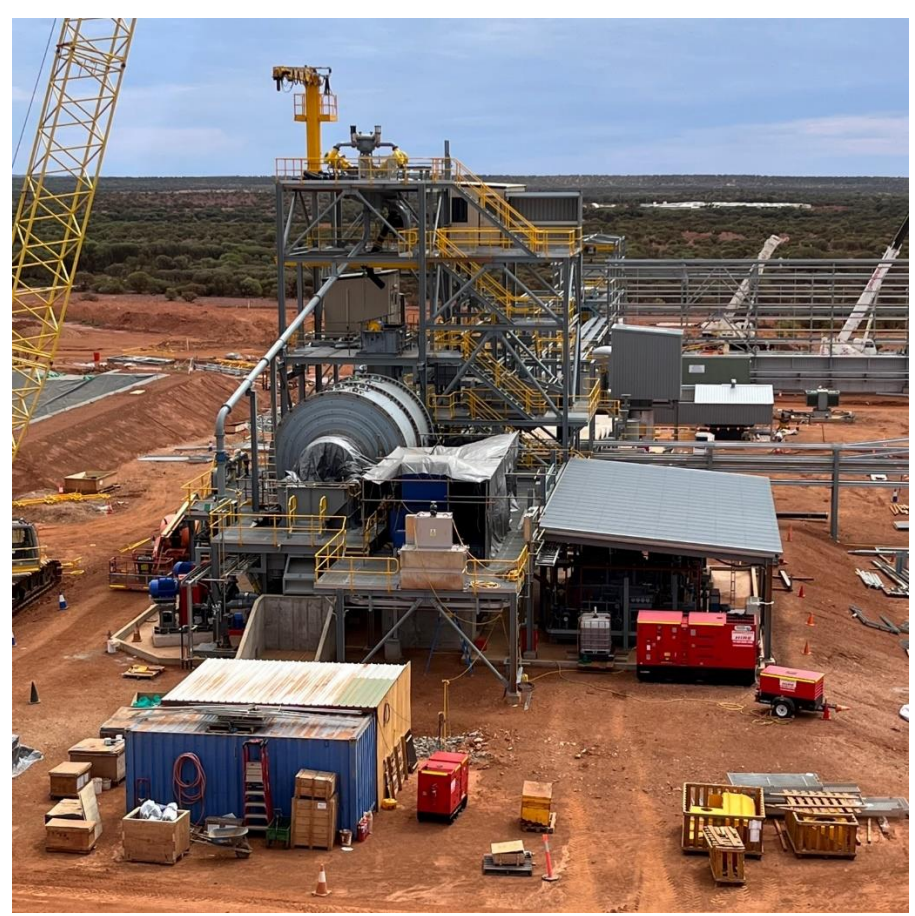
Figure 8 – Abra mill Flotation and concentrate areas (photo 9 September).