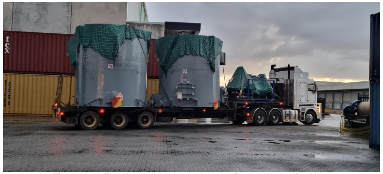
Figure 13 – Flotation cells transport leaving Fremantle port for Abra.