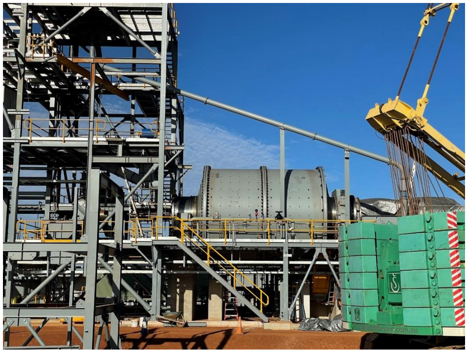
Figure 9 – Mill installation (photo 13 September).