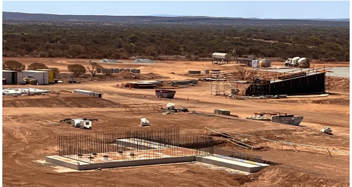
Figure 7 – Processing plant site works showing crusher, screening, and ore storage foundations.

The Board of Directors of Galena authorised this announcement for release to the market.