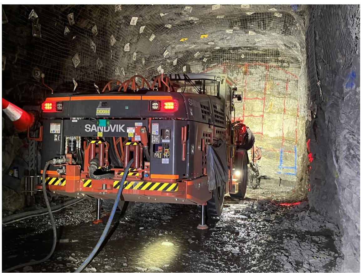
Figure 5 – Underground decline has progressed 440m project to date against a plan of 364m.