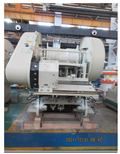
Figure 2 – Manufactured Abra primary Jaw Crusher assembly.