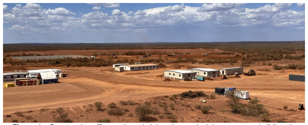
Figure 4 – Construction offices, mine administration, and mining contractor buildings in place. Completed plant site earthworks in the foreground and civil construction occurring in the background on site power station earthworks.