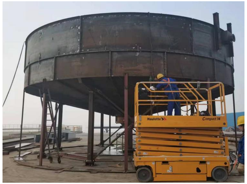
Figure 6 – Concentrate thickener fabrication.