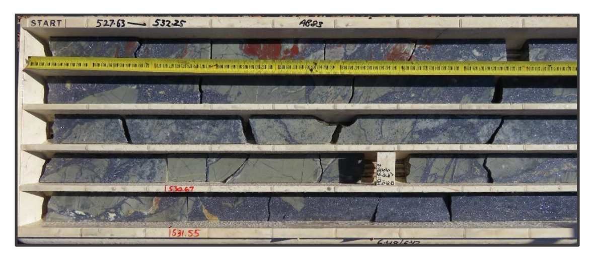
Figure 1: Very high-grade stratiform lead-silver mineralisation within AB83 drill core (527.63m to 532.5m downhole). Dark grey mineral is massive coarse-grained galena (lead sulphide).

results from this drilling program in the coming weeks and the results of a Pre-Feasibility Study for which we are fully funded. This study will be completed in Q3 2018."