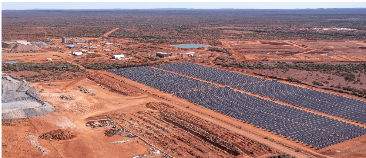
Figure 1 - Abra site with solar farm and village in background (looking west).

The Abra mine construction is progressing as planned. Progress reached 73% complete as of 30 June 2022 and has since past 75% complete. Processing plant construction activities reached 79% complete with concrete civils passing 95% complete and structural steel passing 42% complete. During June and early July several key equipment items arrived on site and the only remaining items coming from overseas are the flotation cells and the regrind mill. These items are currently in shipping with the flotation cells expected to arrive on 12 August and the regrind mill expected to arrive on 1 September. Figures 1 to 4 included in this announcement provide additional photographs of the Abra work completed to date.