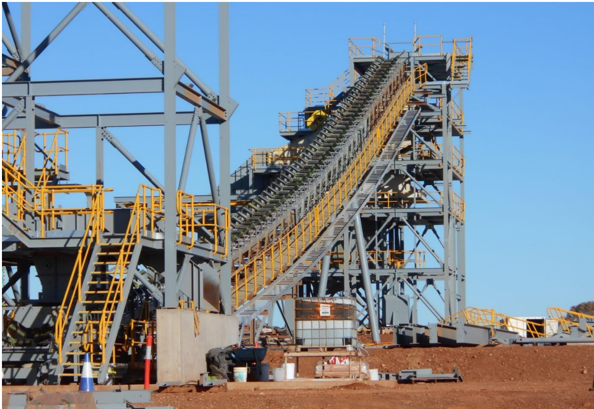
Figure 4 - Abra crushing and screening sections.