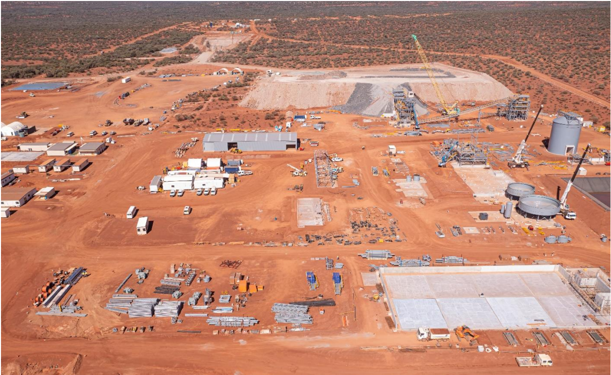
Figure 2 - Abra processing plant construction (looking south).