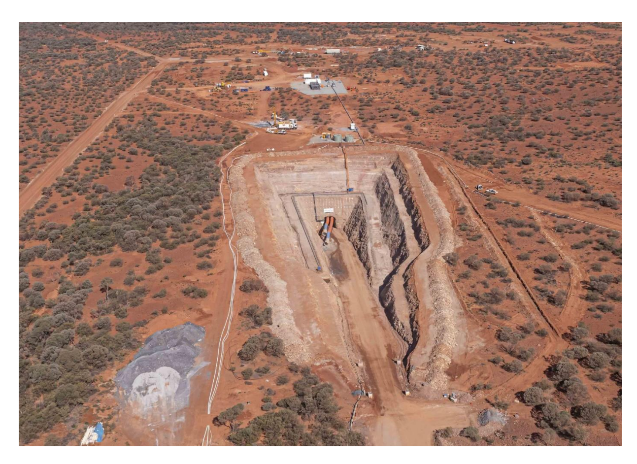
Figure 3 - Abra box-cut (looking south).