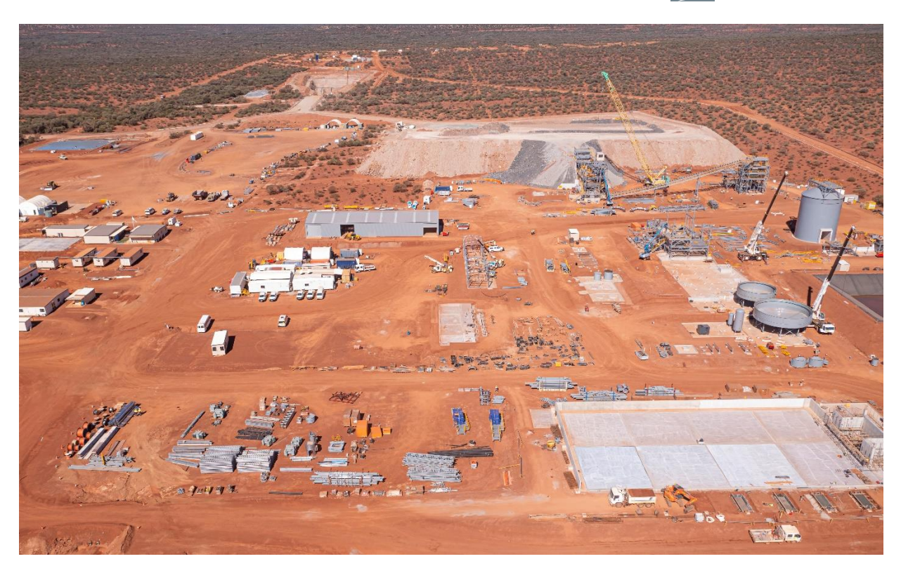
Figure 2 - Abra processing plant construction (looking south).